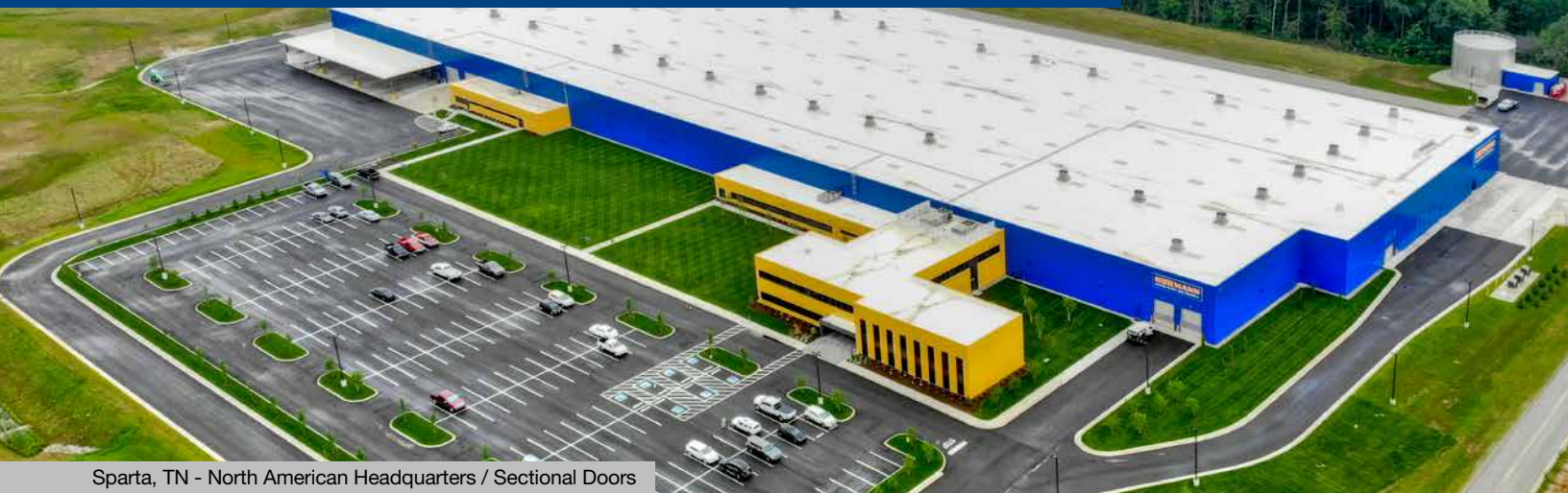
Sparta, TN - North American Headquarters / Sectional Doors