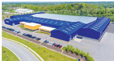
Burgettstown, PA - High Performance Doors

As one of the world's leading manufacturers of doors we're committed to providing the best quality, value, and selection. Whether residential, commercial or industrial, we have the door you're looking for. Each Hörmann product gives you the perfect array of benefits and options to satisfy your customers.