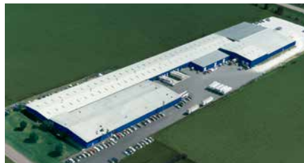
Montgomery, IL - Sectional Doors