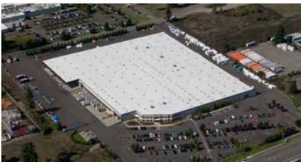
Puyallup, WA - Sectional Doors