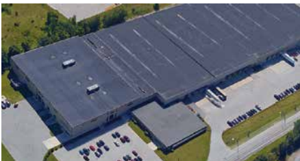
Barrie, ON (CAN) - High Performance Doors